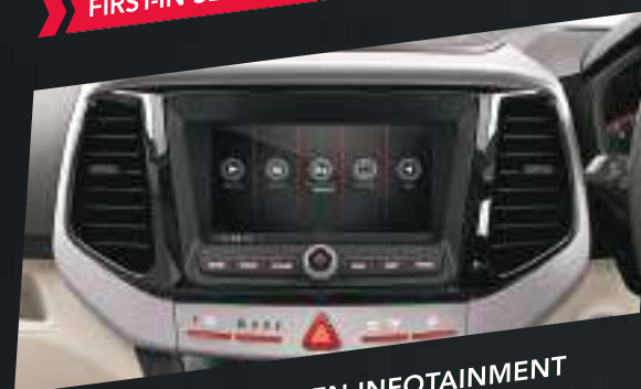
17.78 CM TOUCHSCREEN INFOTAINMENT WITH GPS NAVIGATION, APPLE CARPLAY & ANDROID AUTO™

The XUV300 allows you to adjust the air temperature to create separate, customised environments for the driver and front passenger. With 3 memory slots for your preferred setting, you won't waste time prepping up for your joyride.