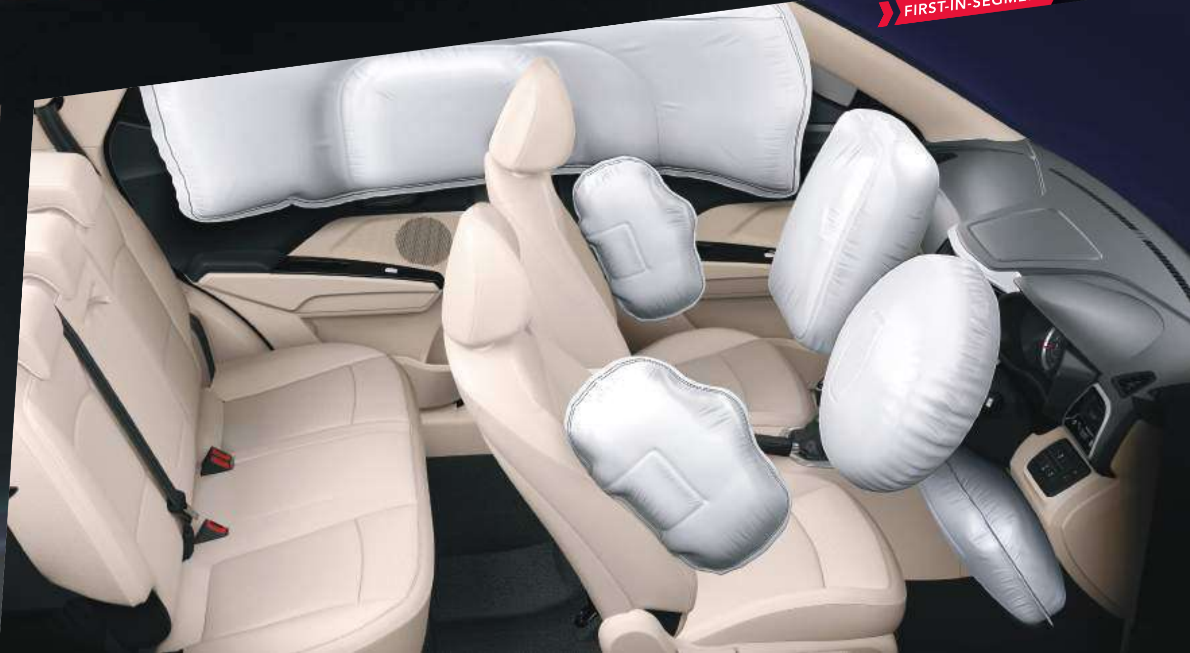
FIRST-IN-SEGMENT 7 AIRBAGS

The XUV300 comes equipped with first-in-segment 7 airbags. They include a knee airbag in addition to dual-front, side and curtain airbags, which provide all-encompassing safety.