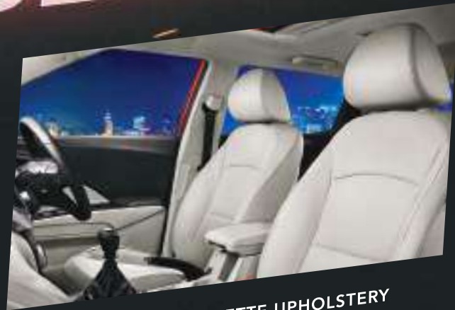
PREMIUM GREY LEATHERETTE UPHOLSTERY