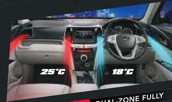
FIRST-IN-SEGMENT DUAL-ZONE FULLY AUTOMATIC TEMPERATURE CONTROL