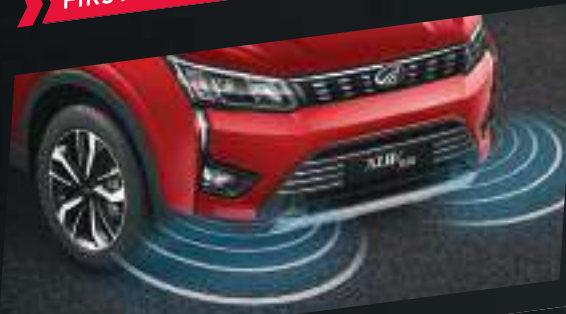
FIRST-IN-SEGMENT FRONT PARKING SENSORS