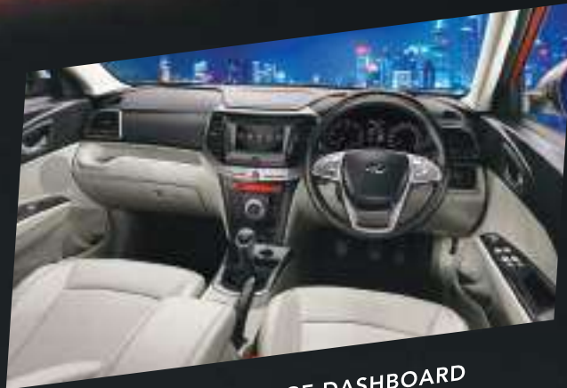
DUAL-TONE BLACK & BEIGE DASHBOARD