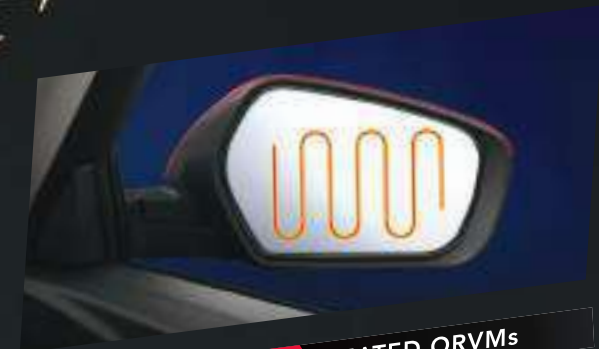
FIRST-IN-SEGMENT HEATED ORVMs

The XUV300 allows you to adjust the air temperature to create separate, customised environments for the driver and front passenger. With 3 memory slots for your preferred setting, you won't waste time prepping up for your joyride.