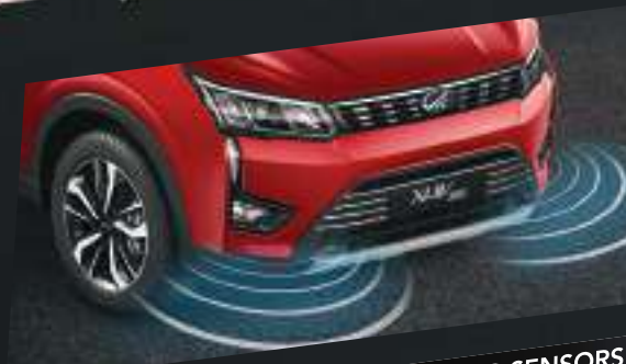
FIRST-IN-SEGMENT FRONT PARKING SENSORS

The XUV300 is home to an array of hi-tech features that take the driving experience to a whole new level. An inviting, 17.78 cm infotainment system dominates the center console. Get GPS navigation, connect your smartphone through Android Auto™ or Apple CarPlay and gain access to a plethora of entertainment and information options from here. For the other vital stats of your SUV, simply glance at the futuristic instrument cluster behind the steering wheel.