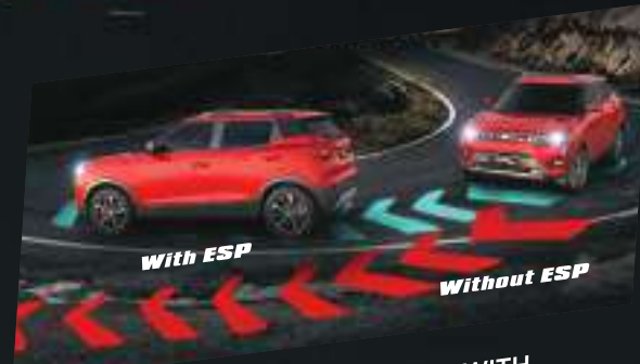
ELECTRONIC STABILITY PROGRAM WITH HILL START ASSIST

Take on the fiercest winters with these unique, first-in-segment ORVMs. They come with a heating facility that gets rid of mist or frost, giving you a clear view of whatever is lagging behind.