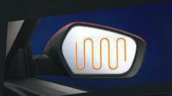
FIRST-IN-SEGMENT HEATED ORVMs

Take on the fiercest winters with these unique, first-in-segment ORVMs. They come with a heating facility that gets rid of mist or frost, giving you a clear view of whatever is lagging behind.