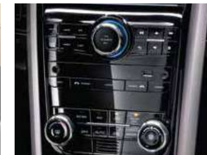
PIANO BLACK CENTRE CONSOLE