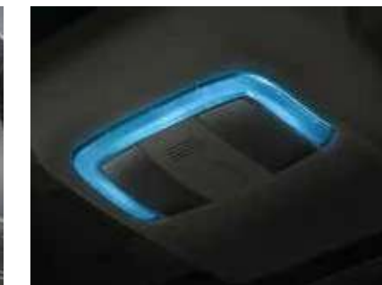
ICY-BLUE LOUNGE LIGHTING