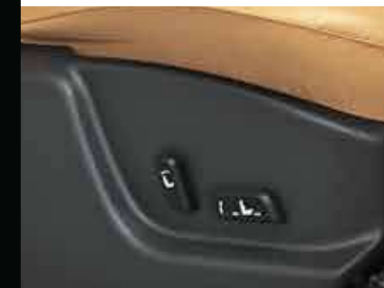
6-WAY POWER-ADJUSTABLE DRIVER'S SEAT

The dashboard and door trims have been fashioned with soft-touch, faux leather with fine stitch lines, elevating the interior's fit and finish by a few notches.