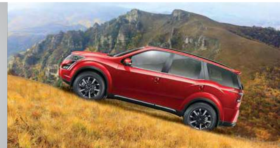
HILL DESCENT & HILL HOLD CONTROL