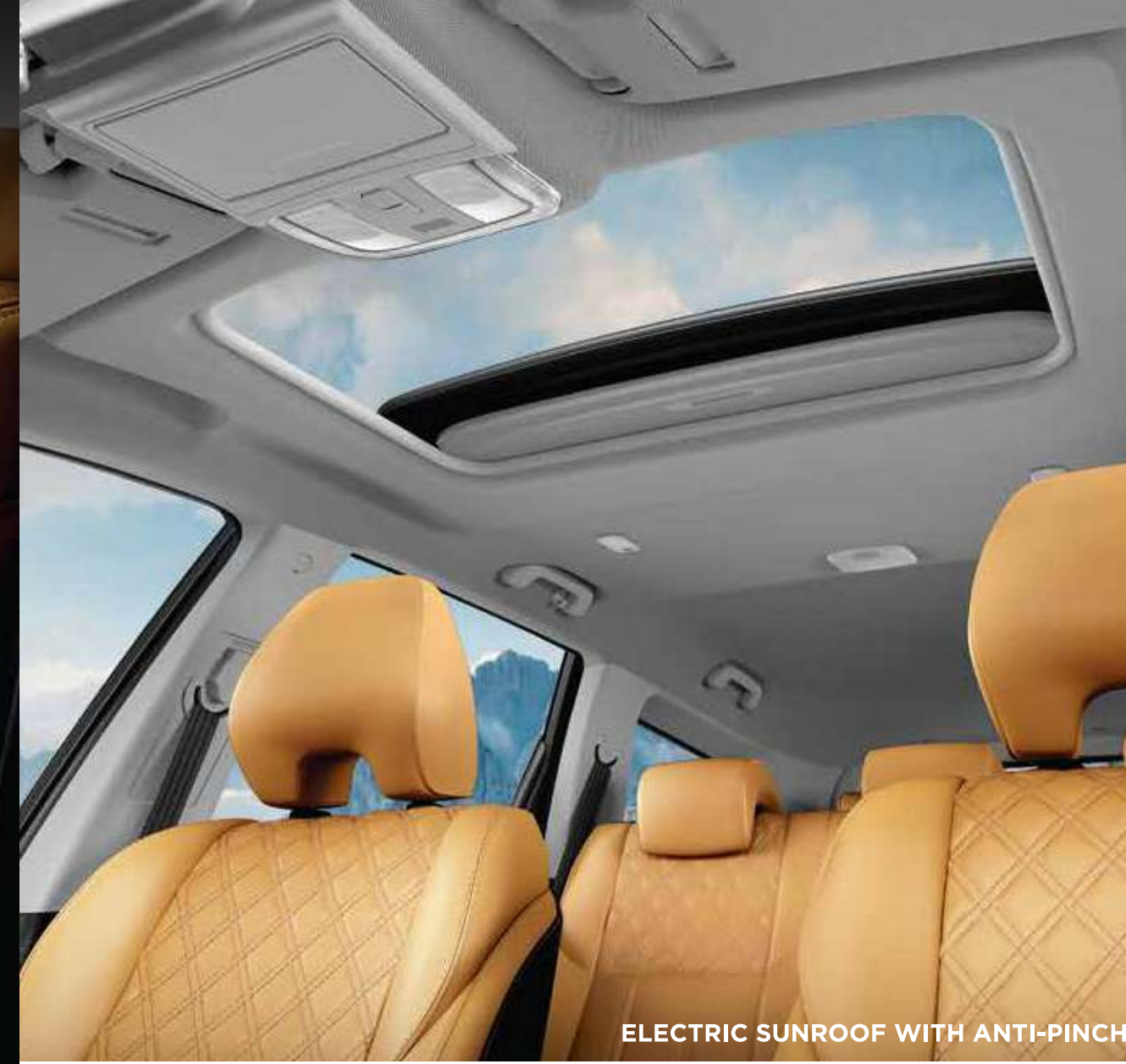
ELECTRIC SUNROOF WITH ANTI-PINCH

Step inside the new XUV500 and you can't help but feel pampered. The immaculate, soft-touch leather craftsmanship with fine stitch lines and piano black centre console add a dash of elegance to the dashboard. And the quilted, tan leather seats further accentuate this feeling of sophistication. But that's not all, look up and you will find the stunning electric sunroof with anti-pinch. Finally, the reduced noise levels, resulting in a much quieter in-cabin experience, ensures that even the most remote adventures, feel nothing short of 5-star extravagance.