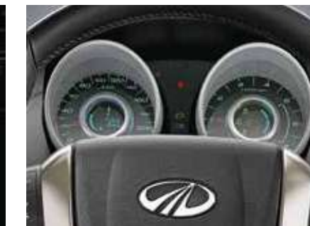
SPORTY TWIN POD CLUSTER