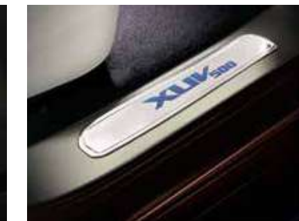
ILLUMINATED SCUFF PLATES